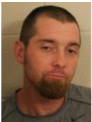
KNIGHT, JOSHUA ADAM

27 Female White 1403 WOODSIDE DRIVE, JOHNSON CITY, TN 37604 11/01/15 E 6TH @ E 1ST ST Thacker, Aaron Rome Police Department 40-5-121(A) - DRIVING WHILE LICENSE SUSPENDED OR REVOKED (MISDEMEANOR) - Cleared by Arrest 40-6-391(A)(1) - Driving Under Influence of Alcohol - Cleared by Arrest 16-10-24(B) - Obstruction of an Officer- Felony - Cleared by Arrest - 2 counts 40-6-74 - Failure to Yield to Emergency Vehicles - Cleared by Arrest 40-6-240 - Improper Backing - Cleared by Arrest 40-6-20 - Failure to obey Traffic-Contro Devices - Cleared by Arrest 40-6-120 - Improper Turn - Cleared by Arrest