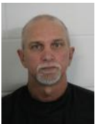
POPE, JASON NATHANIEL

35 Female White 2505 REDMOND CIR NW, ROME, GA 30165 04/10/24 100 MARABLE WAY ROME GA Georgia Department of Community Supervision 42-8-38 - PROBATION VIOLATION (WHEN PROBATION TERMS ARE ALTERED) - FELONY - Cleared by Arrest