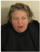
SHELP, PAULA JEAN

30 Male Black or 411 LEAFMORE RD, ROME, GA 30165 03/10/22 BIBB CO JAIL Hall, Chris Floyd County Sheriff's Office 16-5-91(B) - AGGRAVATED STALKING - Cleared by Arrest 16-5-23.1(F)(1) - BATTERY - FAMILY VIOLENCE (1ST OFFENSE) MISD - Cleared by Arrest BNDSMANOFBOND - BONDSMAN OFF BOND - Cleared by Arrest 40-8-73.1 - Window Tint - Cleared by Arrest 16-13-75 - DRUGS NOT IN ORIGINAL CONTAINER - MISDEMEANOR - Cleared by Arrest 16-13-30(A) - POSSESSION OF A SCHEDULE IV CONTROLLED SUBSTANCE - Cleared by Arrest 16-13-30(J) - PURCHASE, POSSESSION, MANUFACTURE, DISTRIBUTION, OR SALE OF MARIJUANA - Cleared by Arrest 16-13-30(A) - POSSESSION OF COCAINE - Cleared by Arrest 16-13-30(A) - POSSESSION OF A SCHEDULE II CONTROLLED SUBSTANCE - Cleared by Arrest