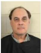
BROCK, NORMAN LEE JR

22 Female White 219 RIPPLING DR, MARIETTA, GA 30064 07/22/22 GA 1 LOOP @ BLACKS BLUFF RD Georgia State Patrol Bonded Out 40-6-390 - Reckless Driving - Cleared by Arrest 40-6-181 - Speeding in Excess of Maximum limits - Cleared by Arrest 40-6-395(B)(1) - FLEEING OR ATTEMPTING TO ELUDE A POLICE OFFICER - Cleared by Arrest