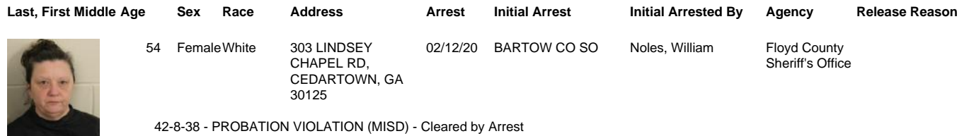
KNIGHT, AUDREY DENISE