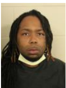
ZACHARY, JONATHAN JR

22 Female White 15 NATURES WALK TRL, ROME, GA 30161 04/27/20 501 REDMOND CIRCLE LIVELY, CARL Floyd County Police Department 16-5-60(B) - RECKLESS CONDUCT - Cleared by Arrest 16-13-32.2 - POSSESSION AND USE OF DRUG RELATED OBJECTS - Cleared by Arrest 16-13-30(A) - POSSESSION OF A SCHEDULE I CONTROLLED SUBSTANCE - Cleared by Arrest 42-8-38 - PROBATION VIOLATION (WHEN PROBATION TERMS ARE ALTERED) - FELONY - Cleared by Arrest