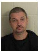
ERTEL, MARK CHRISTOPHER

51 Female White 160 LAWRENCE CT, ADAIRSVILLE, GA 30103 09/06/19 CHATILLON @ RIVERSIDE BRADLEY, GENERROW Rome Police Department Bonded Out 40-6-391(A)(1) - Driving Under Influence of Alcohol - Cleared by Arrest 40-6-49 - Following too Closely - Cleared by Arrest