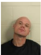
ROBERTS, JOE WAYNE

46 Female Black 823 ASHLAND PARK BLVD NE, ROME, GA 30161 12/10/19 PROBATE COURT BLANKENSHIP, JEFFREY Floyd County Sheriff's Office 42-8-38 - PROBATION VIOLATION (MISD) - Revocation of Probation (CCH - 519)