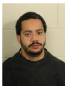
CLIFTON, KEVIN VON

43 Female White 5540 FOSTERS MILL ROAD, CAVE SPRING, GA 30124 12/07/18 5540 FOSTER MILLS RD TAYLOR, CATHY Floyd County Police Department 16-13-75 - DRUGS NOT IN ORIGINAL CONTAINER - MISDEMEANOR - Cleared by Arrest 16-13-30(A) - POSSESSION OF A SCHEDULE II CONTROLLED SUBSTANCE - Cleared by Arrest 16-13-2(B) - MARIJUANA-POSSESS LESS THAN 1 OZ. - Cleared by Arrest 16-13-32.2 - POSSESSION AND USE OF DRUG RELATED OBJECTS - Cleared by Arrest 16-13-30(A) - POSSESSION OF METHAMPHETAMINE - Cleared by Arrest